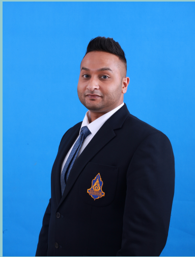
Chief Executive Officer