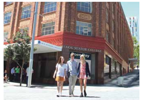
ACG Senior College