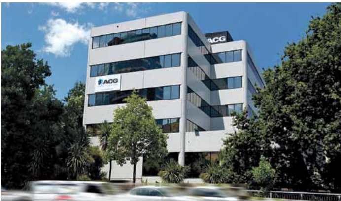
ACG English School

The University of Auckland Certificate in Foundation Studies