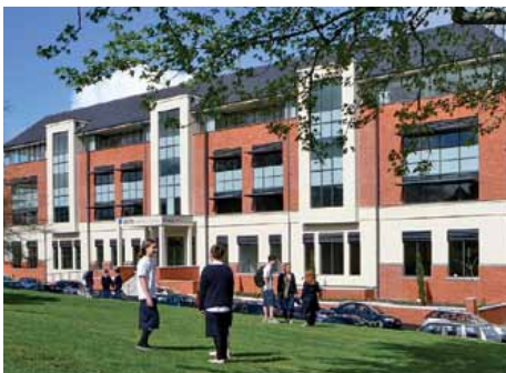
ACG Parnell College