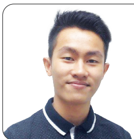
Cham Hiew Thong Graduate Foundation in Science

* The College reserves the right to make changes to this brochure due to regulations, syllabus, locations and other relevant details without prior notice.