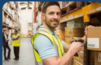
Supply Chain and Logistics