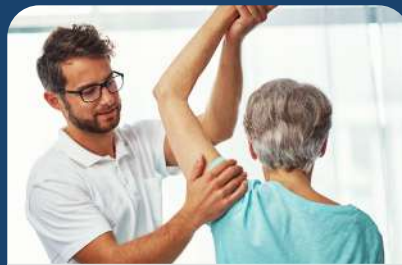
Physiotherapist & Occupational Therapist Assistant