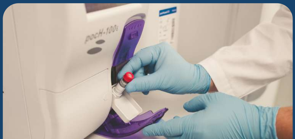
Medical Laboratory Technician