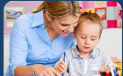
Developmental Service Worker