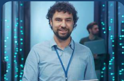
Advanced Diploma in Cisco and Red Hat Engineering