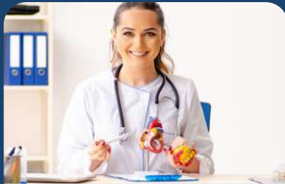
Cardiology Technologist *Accredited*