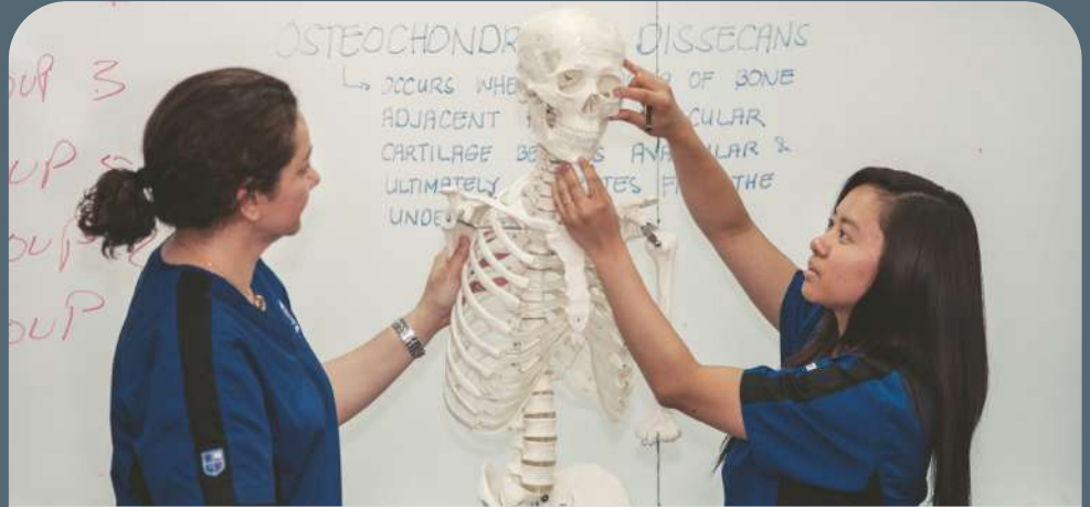
Physiotherapist & Occupational Therapist Assistant