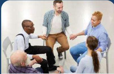
Community Service Worker