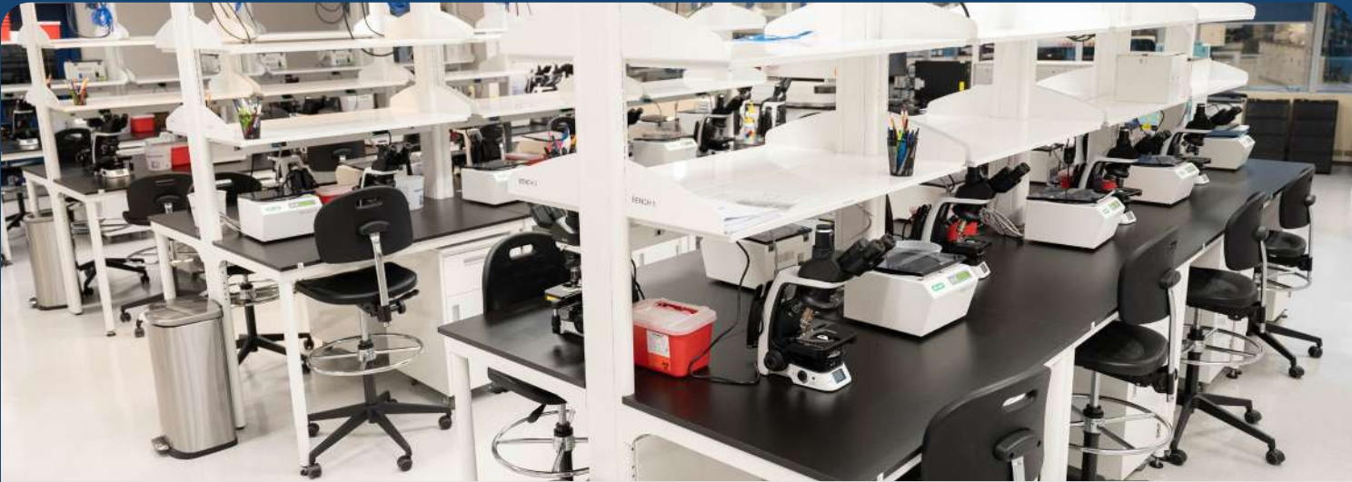
Medical Laboratory Technology Hybrid