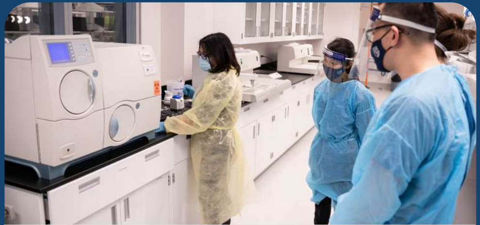
Medical Laboratory Technology Hybrid