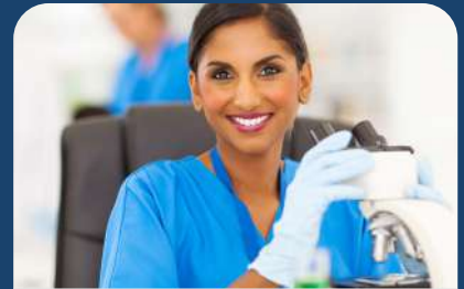
Medical Laboratory Technician *Accredited*