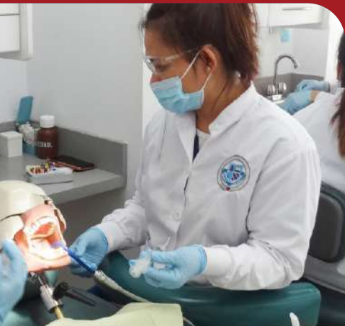
Level I & II Dental Assistant