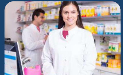
Retail Pharmacy Assistant