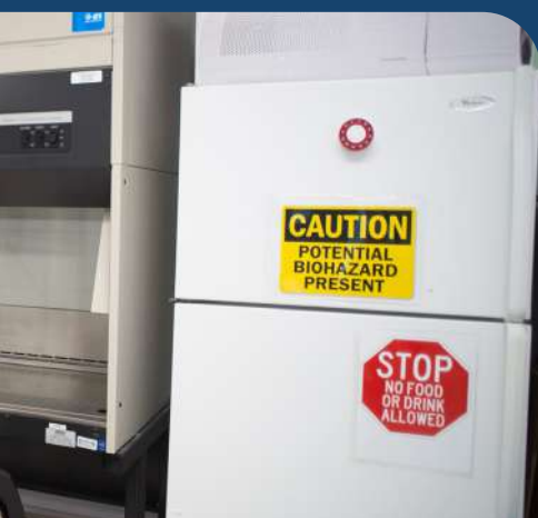
Medical Laboratory Technician