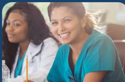
Health Information Management *Accredited*