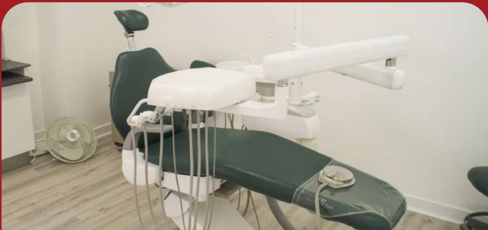
Intra Oral Level I & II Dental Assistant