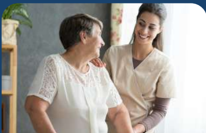
Personal Support Worker