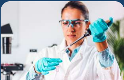
Medical Laboratory Technology Hybrid *Accredited*