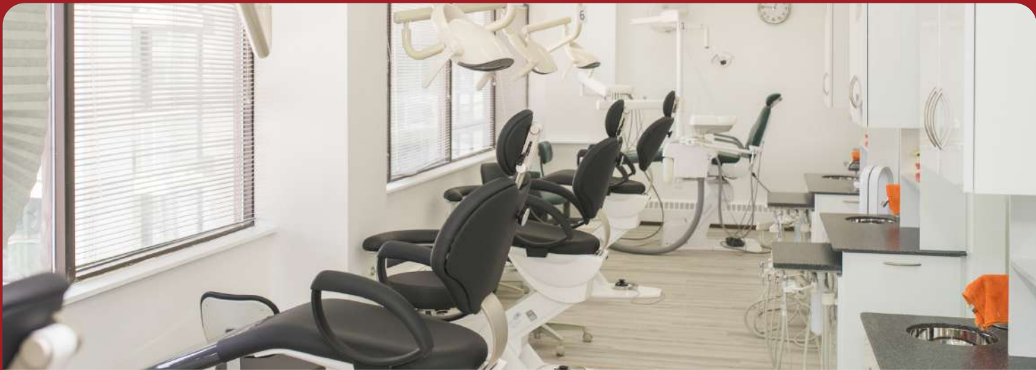
Intra Oral Level I & II Dental Assistant