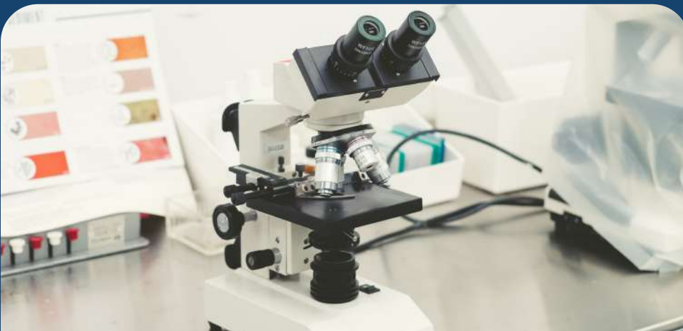
Medical Laboratory Technician