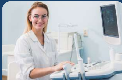
Diagnostic Medical Sonographer *Accredited*