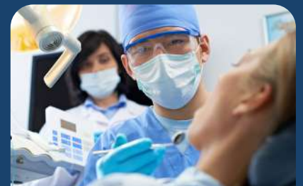
Intra Oral Level 1 & 2 Dental Assistant