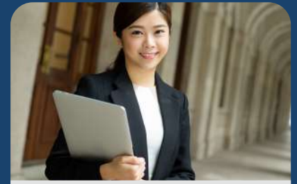
Paralegal Studies *Accredited*