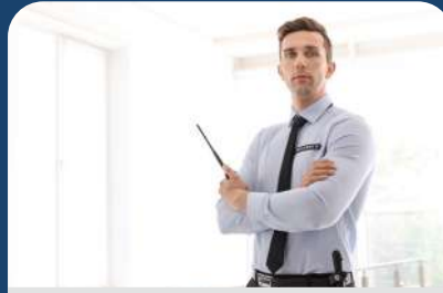
Law Enforcement / Police Foundations