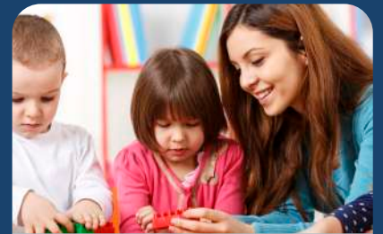
Early Childcare Assistant