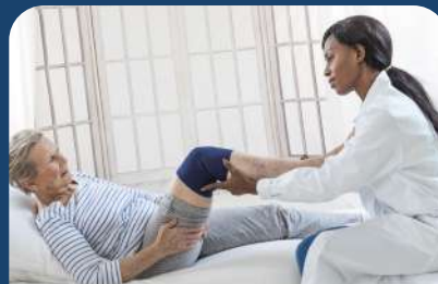
Rehabilitation Physiotherapy Assistant