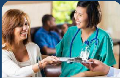
Medical Office Administrator