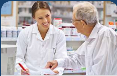
Pharmacy Technician * Accredited *