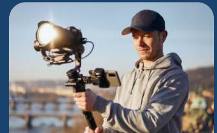
Film and Video Production, Storytelling for the Digital Age