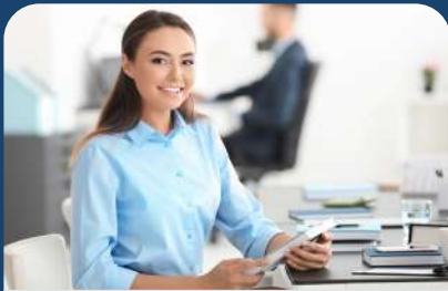
Accounting & Payroll Administration