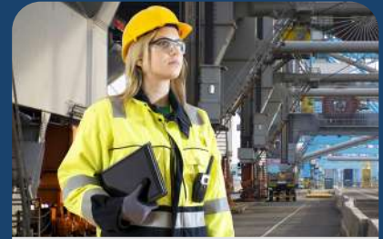
Occupational Health & Safety