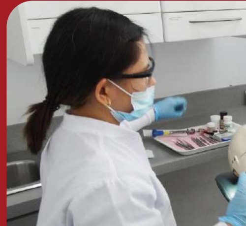
Intra Oral Level I & II