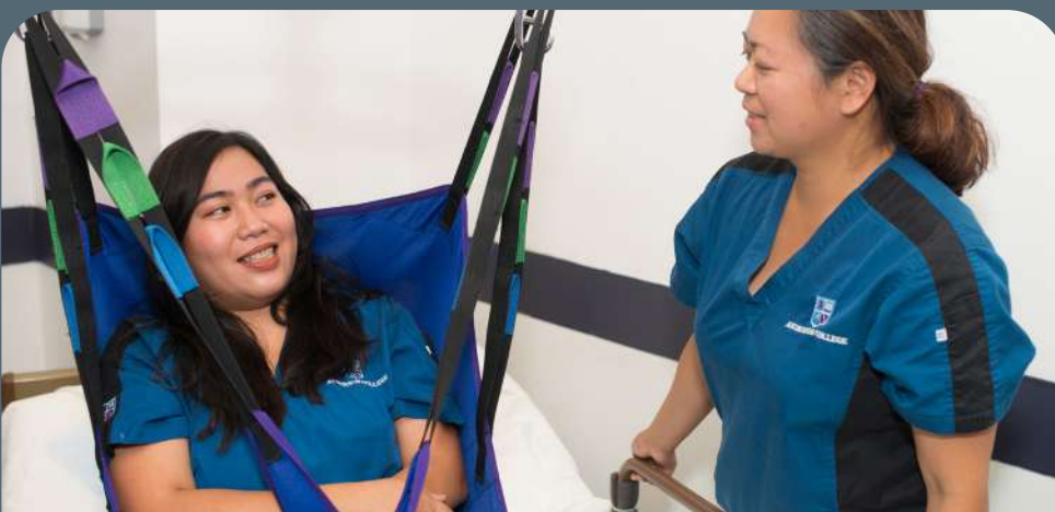
Personal Support Worker