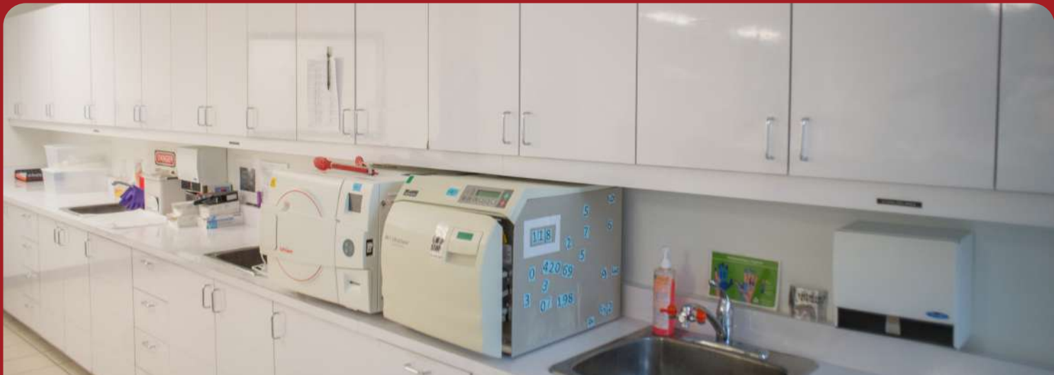
Intra Oral Level I & II Dental Assistant