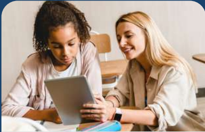
Child & Youth Care with Addictions Support Worker