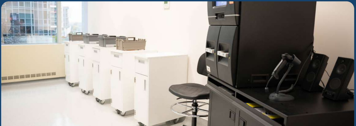
Medical Laboratory Technology Hybrid