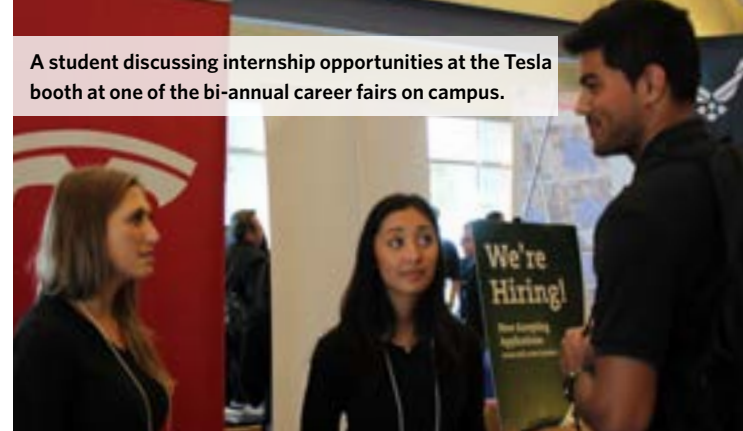
A student discussing internship opportunities at the Tesla booth at one of the bi-annual career fairs on campus.