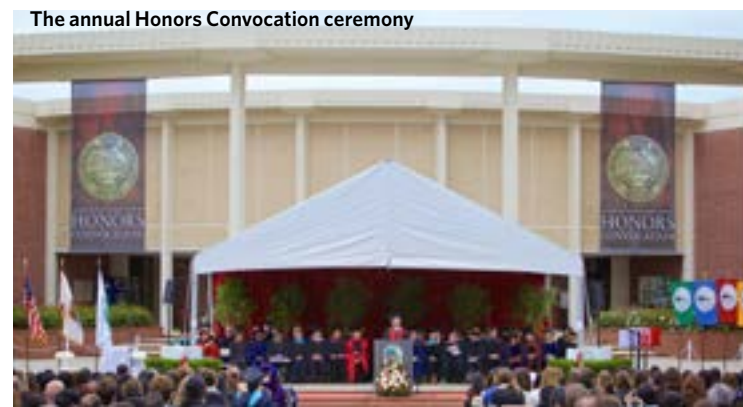
The annual Honors Convocation ceremony