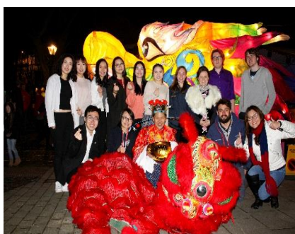
Local Chinese New Year Celebration