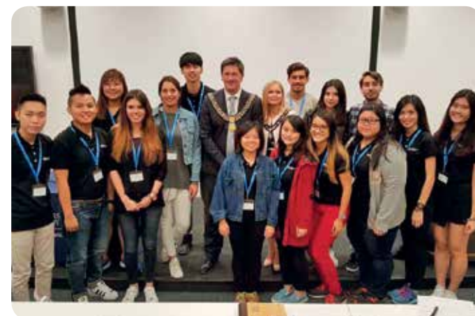
Students were given a warm welcome by the Mayor of Derby Councillor John Wiltby (centre).