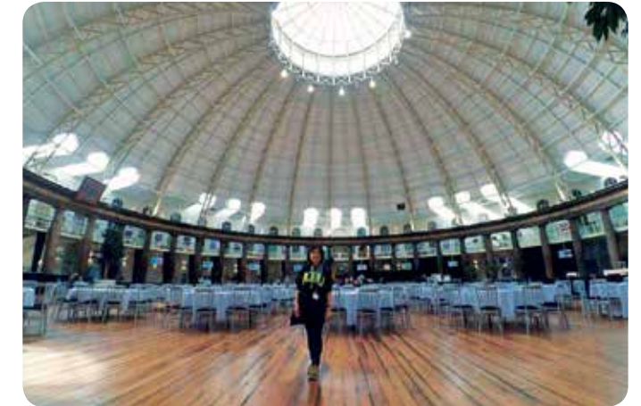
The Devonshire Dome in the Buxton Campus - a stunning heritage project - now hosts the UK's premier events and banquets.