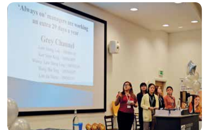
HELP students presenting their solutions at the Chartered Management Institute Student Challenge 2017.