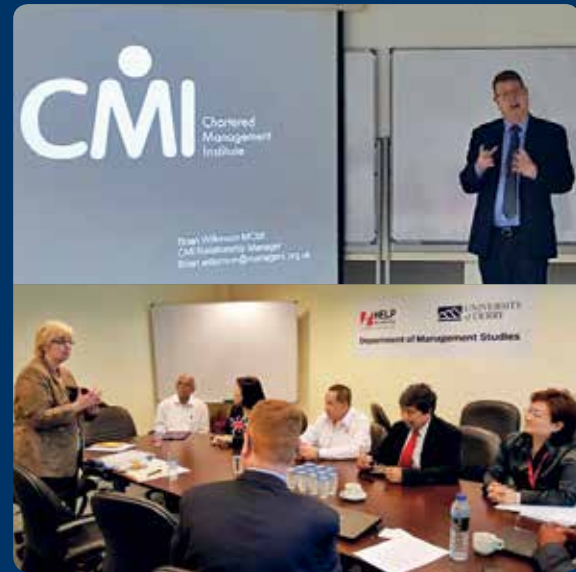
Constant staff development sessions are carried out by the UoD and CMI representatives on an annual basis as a continuous enhancement process for the teaching and administrative team at HELP Academy.

“You always get the help you need to develop your crucial skills, and learning at HELP Academy has put me on track for my future. One of the best aspects was how we were encouraged to think critically and act creatively.”