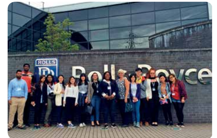
A visit to the Rolls Royce facility provided a case study of RR as a global market leader in high performance power systems.