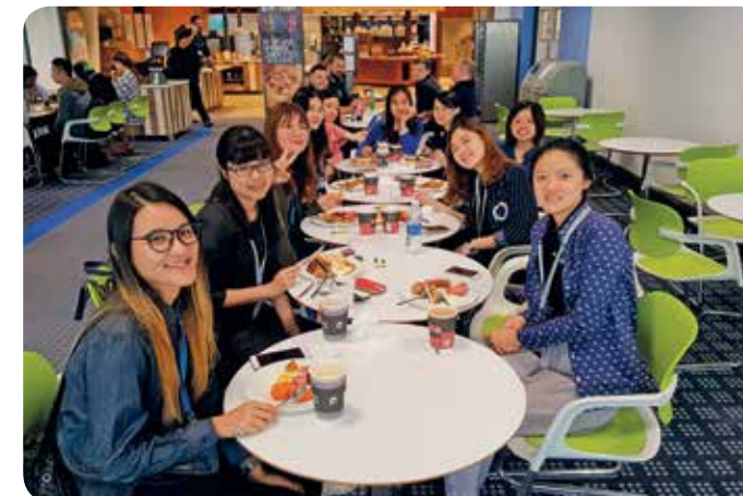
Chilling out in the university canteen.