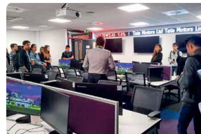
A first-hand look at the workings of the Bloomberg Financial Market Lab which services financial institutions worldwide.