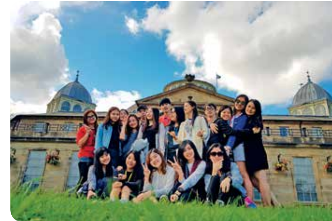
The scenic University of Derby Buxton Campus