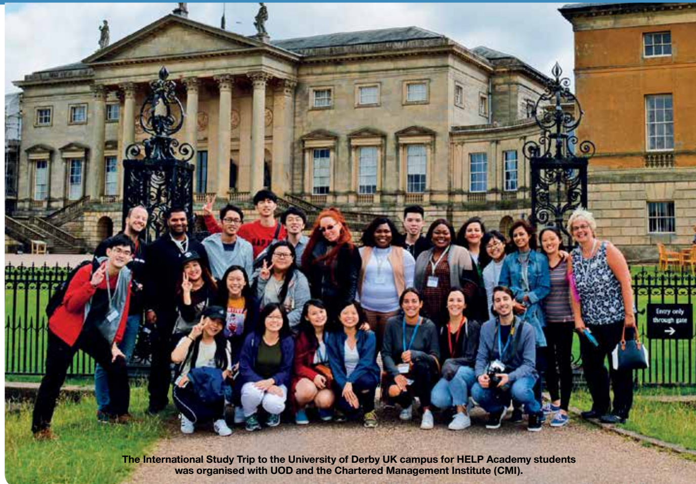
The International Study Trip to the University of Derby UK campus for HELP Academy students was organised with UOD and the Chartered Management Institute (CMI).