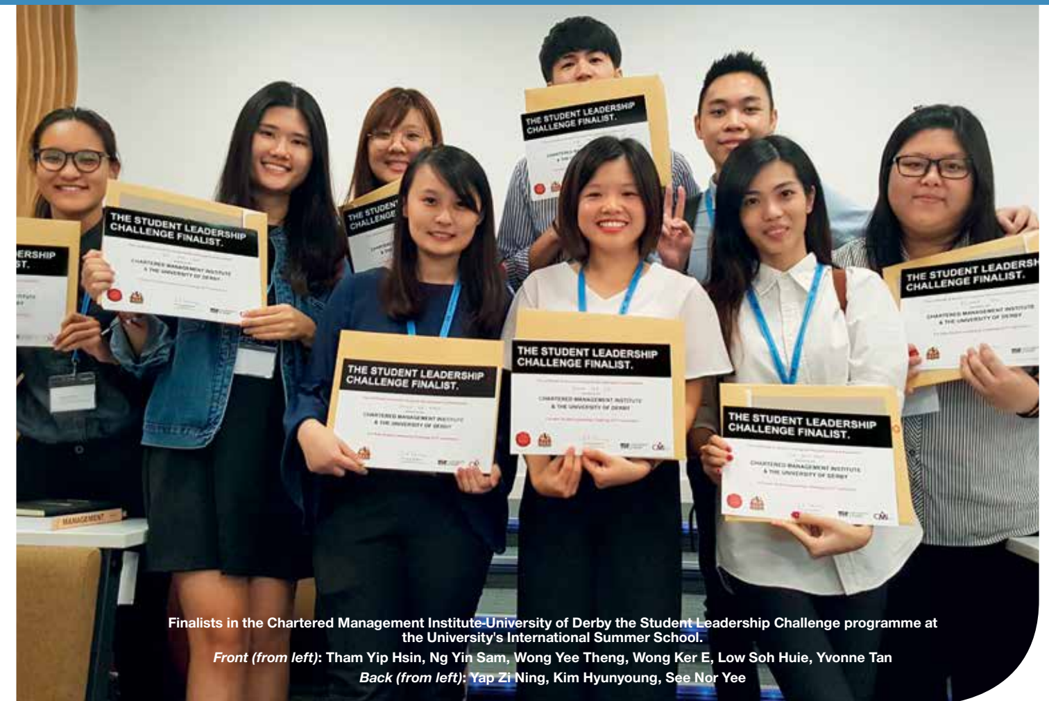
Finalists in the Chartered Management Institute-University of Derby the Student Leadership Challenge programme at the University's International Summer School.

Applicants require one of the following: • Credit in SPM/O-Level English • B6 in UEC English • IELTS score of 5.5 or equivalent