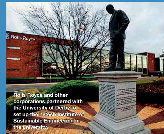
Rolls Royce and other corporations partnered with the University of Derby to set up the hi-tech Institute of Sustainable Engineering in the university.

Included in the 3+0 programmes is a 10-day trip to Derby for registered students. They will participate in academic activities and seminars, network with Derby students and faculty members, and visit Derby’s industry partners like Rolls Royce.