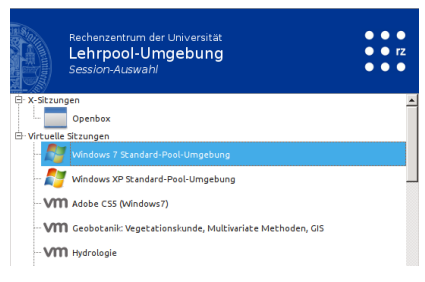
bw-Lehrpool: menu of machines

Should your course specify a specific environment with its own software configuration, please choose this environment; otherwise you can select one of the default environments under