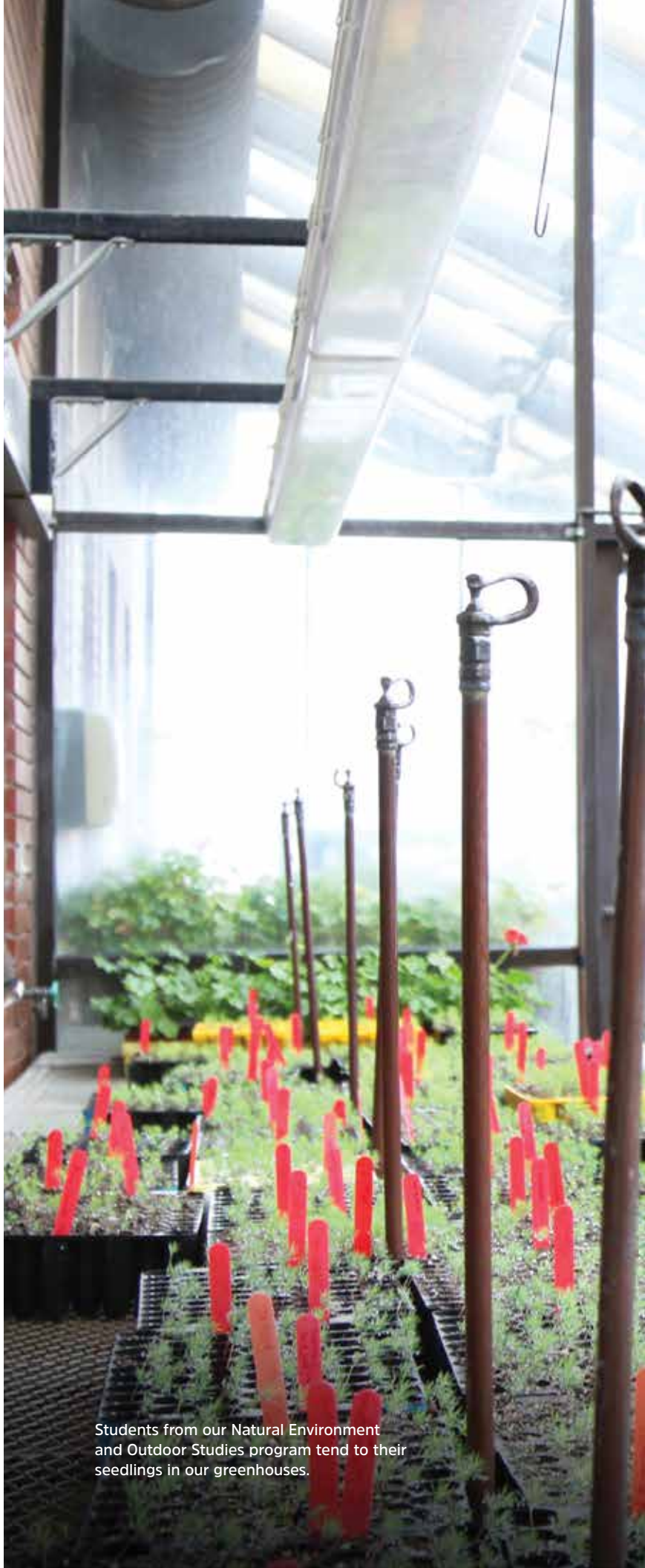
Students from our Natural Environment and Outdoor Studies program tend to their seedlings in our greenhouses.