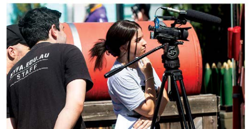
Teen Camp Students Shooting their Films at Warner Bros. Movie World