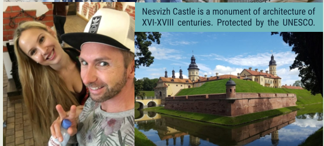
Nesvizh Castle is a monument of architecture of XVI-XVIII centuries. Protected by the UNESCO.